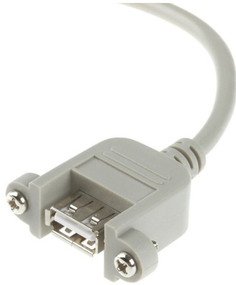
USB 2.0 A Buchse / female / femelle