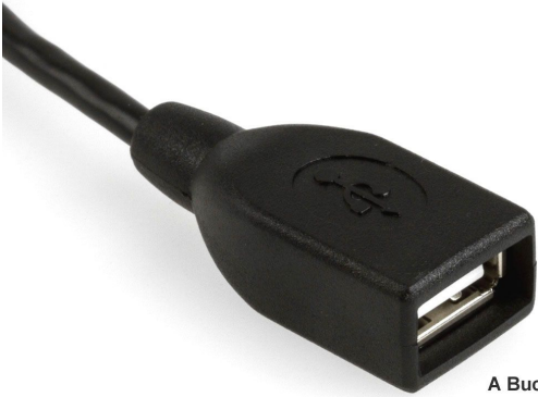
A Buchse A female A femelle