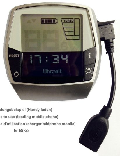
Anwendungsbeispiel (Handy laden) example to use (loading mobile phone) exemple d'utilisation (charger téléphone mobile) E-Bike