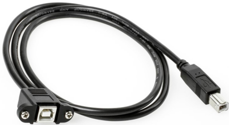
E238846 UL AWM 2725 80°C 30V VW-1