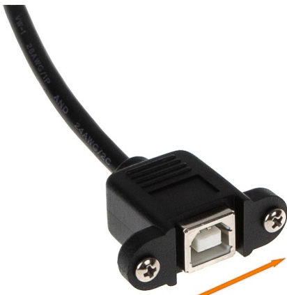
30mm Schraubenabstand screw distance distance entre les vis