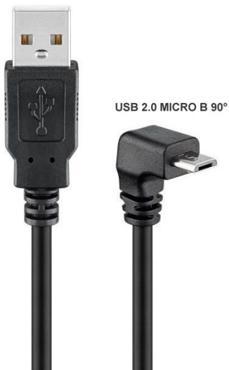
USB 2.0 MICRO B 90°